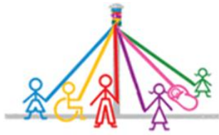
Leeds SEND Information Advice Support Service